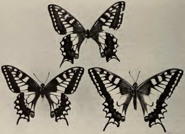
FIG. 2. Papilio machaon from Arabia. Top row, ssp. rathjensi from Yemen; bottom left, ssp. syriacus from the oasis at Hofuf in eastern Saudi Arabia; bottom right, ssp. muetingi from Oman (slightly smaller than natural size).

R. Ent. Soc. Lond. 115: 239-259) illustrates this well in the African Papilio dardanus Brown. However, given the fact that literally thousands of P. machaon from all over its range have been dissected, none of which show the degree of reduction in harpe found in saharae , one feels safe in assuming a close relationship between rathjensi and saharae .